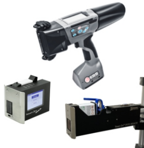
Ink Jet Printers