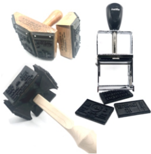
Industrial Rubber Stamps

We welcome any and all inquiries regarding our Marking Products and look forward to working with you and your company.