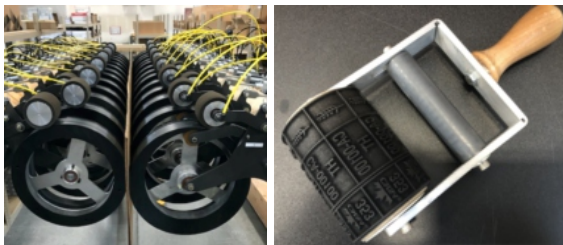
Contact Marking Equipment