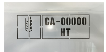
Stencils, Inks & Applicators