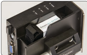
Redesigned Printer Head