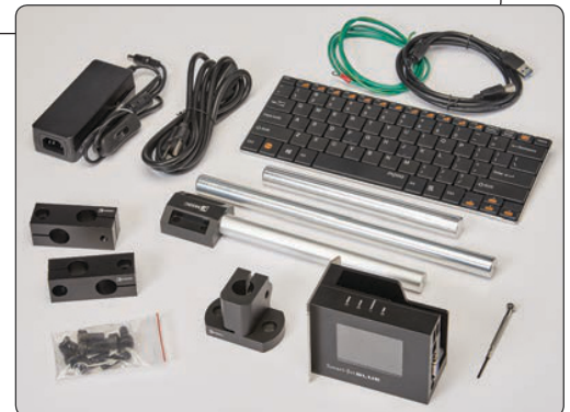
Pieces included in package