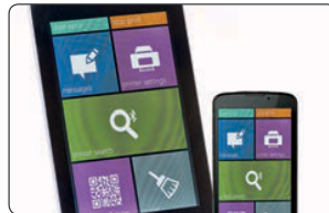
App works on Android devices