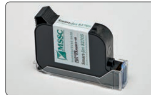
TIJ cartridge technology